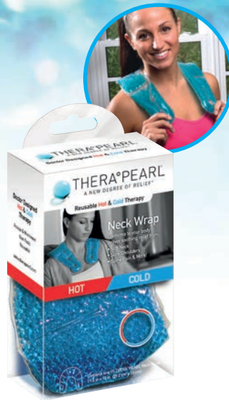
091554732 TheraPearl® Neck Wrap