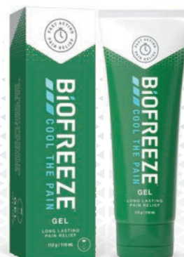
2 BIOFREEZE® Gel 112g/118ml