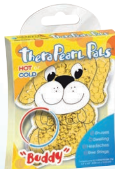
091554807 TheraPearl Pals® Puppy