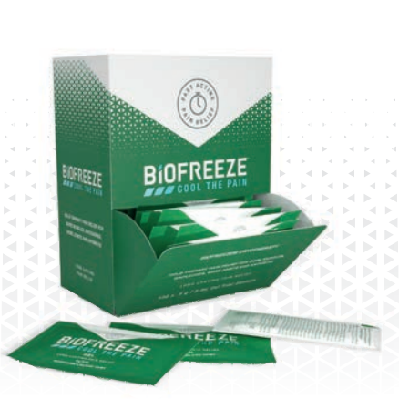
8 BIOFREEZE® Gravity Feed Box of 100 5g/5ml Sachets 7500142