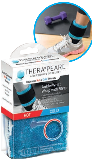
091554765 TheraPearl® Ankle/Wrist Wrap with Strap