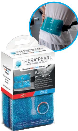
091554708 TheraPearl® Back Wrap with Strap