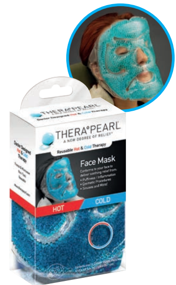
091554930 TheraPearl® Face Mask