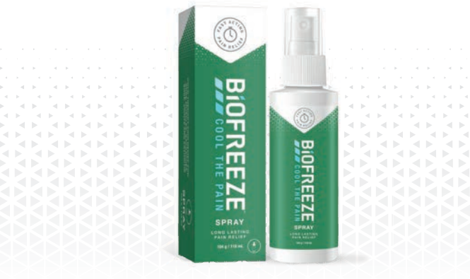
4 BIOFREEZE® Spray 104g/118ml 7500147