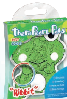
091554799 TheraPearl Pals® Frog