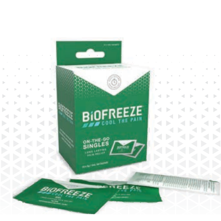
10 BIOFREEZE® Display Box* Box of 10 5g/5ml Sachets 7500141