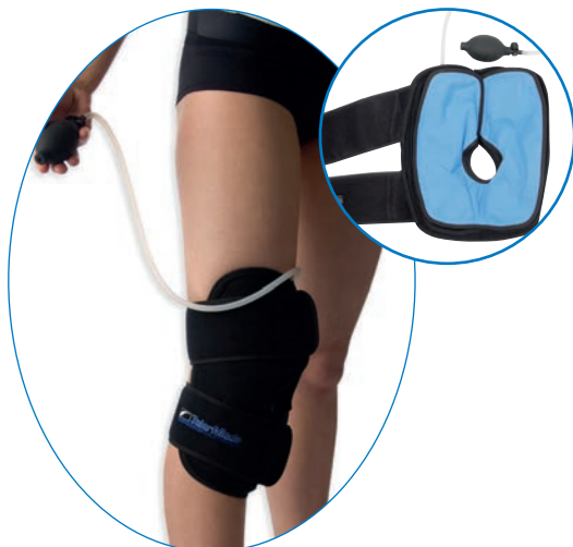
091530898 Knee Support O.S.F.A