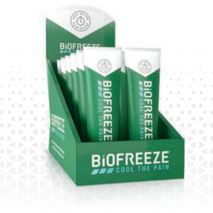
9 BIOFREEZE® Display Tray 12 x 28g/30ml Gel 7500140