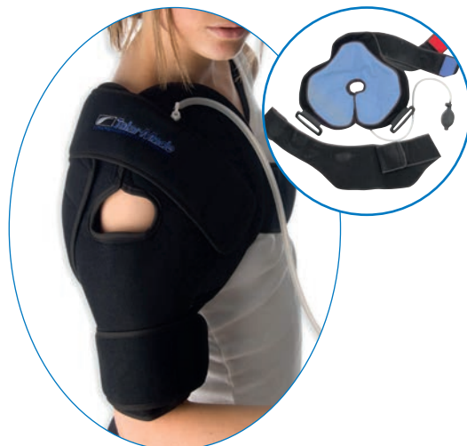
091530989 Shoulder Support O.S.F.A