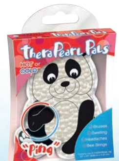
091554781 TheraPearl Pals® Panda