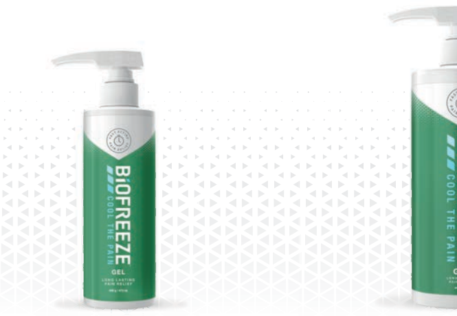
5 BIOFREEZE® Gel Pump 448g/473ml 7500149

Our professional size products are ideal for clinics, hospitals or just every day use