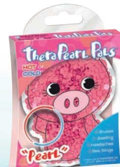
091554773 TheraPearl Pals® Pig