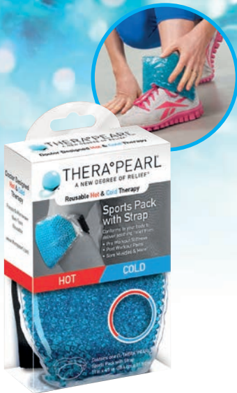
091554716 TheraPearl® Sports with Strap