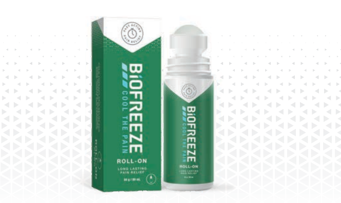
3 BIOFREEZE® Roll-on 84g/89ml 7500146