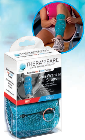
091554757 TheraPearl® Shin Wrap (2 Pack)