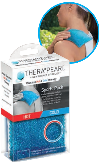
091554740 TheraPearl® Sports Pack