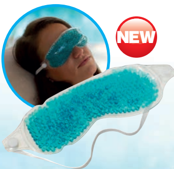
7500089 TheraPearl Eye Mask