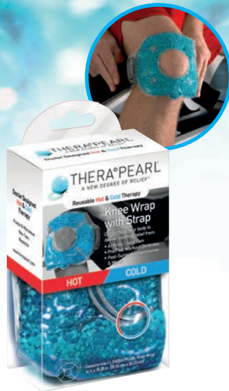
091554724 TheraPearl® Knee Wrap