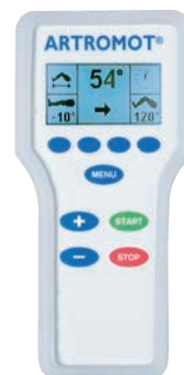
HANDHELD PROGRAMMING UNIT ARTROMOT-K1 STANDARD