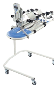
MODULAR TRANSPORT TROLLEY